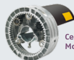
Centreo RTS Motor